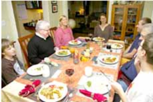
Keep a colorful Guest at Your Table box in a prominent place in your home, like the dining room table.

During Guest at Your Table, you keep a Guest-at-Your-Table box — with photographs of special guests from around the world — in a prominent place in your home, like the dining room table.