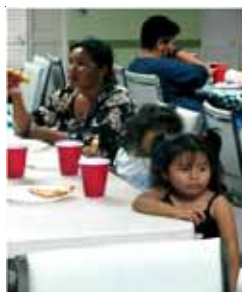
UUCL hosts CIW meeting